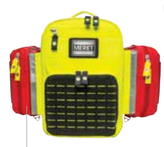
TS2 Ready<sup>™</sup> hideaway zippers for 2 optional side TS2 Ready<sup>™</sup> modules

Product Dimensions: 18.5" x 13" x 10.5" Product Weight: 8lbs 1oz M4L Lifetime Warranty