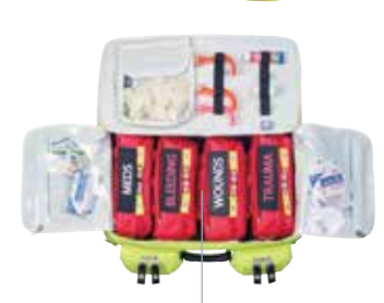
Fits 4+ TS2 Ready<sup>™</sup> modules internally

Zippered internal compartment with clear view pockets