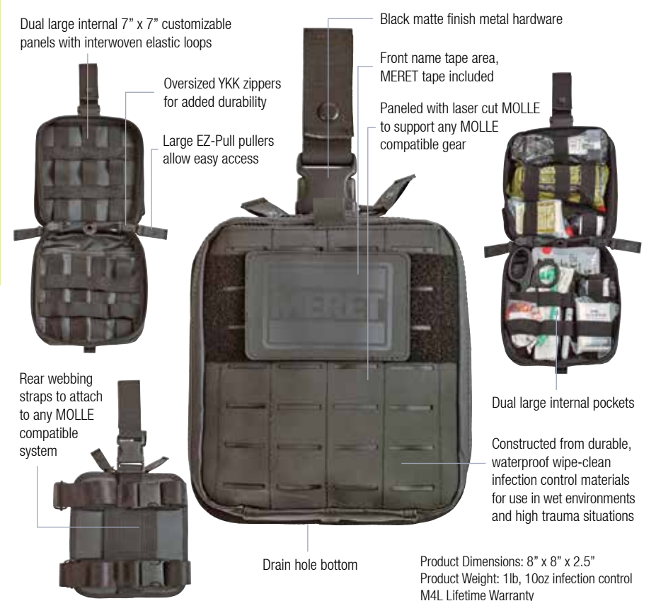
Large belt side release buckle

The ALPHA3™ PRO X Thigh Pack provides quick-reach access to life sustaining critical care supplies at arm's length, with COMPLETE INFECTION CONTROL . Designed for active tactical medics with varying requirements, the ALPHA3<sup>™</sup> PRO X is completely customizable on the inside and out to provide organized access to a range of medical supplies. With industry leading construction and components, the ALPHA3<sup>™</sup> PRO X delivers a solid leg side solution to address a variety of assault-aid trauma situations.