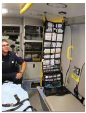
Designed to secure in a range of paramedic vehicles for quick easy access to critical and commonly used items for treating patients while on the move